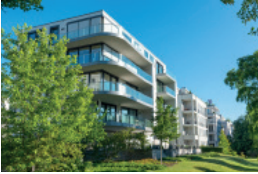
Open networks have made the property developer's EV charging stations accessible to more EV drivers in the U.S.